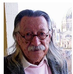
Joseph Weizenbaum: former MIT professor and computer scientist who developed ELIZA, a primitive computer program utilizing natural language processing.